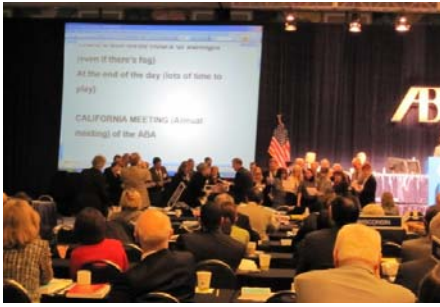
California delegation invites everyone to the Annual Meeting in San Francisco in August.

The California delegation invited everyone to the Annual Meeting in San Francisco Aug. 5-10, 2010, by serenading the House of Delegates with its rendition of California Dreamin.' It should be noted that the San Francisco Giants will be playing the Chicago Cubs Monday and Tuesday, Aug. 9-10. For those of you who would like to calendar next year's Midyear Meeting, it will be in Atlanta, Feb. 1-7, 2011. If you have any questions or would like to discuss any issues with me, please feel free to contact me at 312-899-9090 or visit my firm's website at http://www.cliffordlaw.com/abaillinoisstatedelegate .