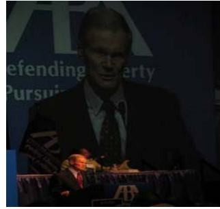
Senator Bill Nelson of Florida addresses the House of Delegates.

Senator Bill Nelson addressed the House of Delegates in a speech about protecting the underprivileged under principles of equality and human dignity which require a fair and impartial judiciary. "One of the challenges we face in trying to remain a just society is to ensure that every person - harmed or aggrieved for any reason - is able to find a place in our system of justice." Sen. Nelson also acknowledged the ABA's work in creating the Haiti Legal Development Fund that "should go a long way toward helping rebuilding Haiti's legal and judicial system." Nelson flew on the Space Shuttle Columbia 24 years ago and is the only lawyer to fly in space.