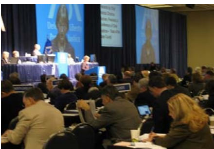
Justice Christine Durham speaks to the House of Delegates.

Chief Justice of the Utah Supreme Court Christine Durham who also serves as President of the Conference of Chief Justices spoke to the House of Delegates during its first day in session. She talked of the "correlation between the decisional independence of the state courts and their institutional independence." She also spoke of the current economic recession in the country creating growing backlogs in state courts. "With priority given to serious criminal cases, there is a looming threat to the civil justice system and its ability to vindicate people's rights, and to foster economic growth and stability by enforcing business contracts in a timely manner." The "silver lining," she said, "is that state courts are taking the opportunity to re-evaluate old ways of doing things and coming up with better approaches."