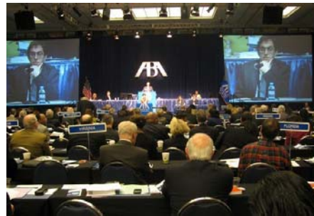
An all-star panel addresses the House of Delegates on the selection of Supreme Court justices.