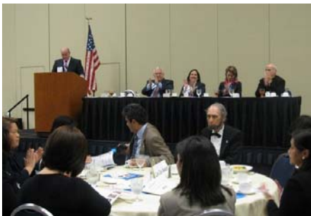
Spirit of Excellence Awards Luncheon.

An award-winning Abraham Lincoln portrayer made a presentation aimed at helping promote a greater understanding and appreciation of the law and the life of America's 16th President.