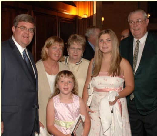
The Durkin family