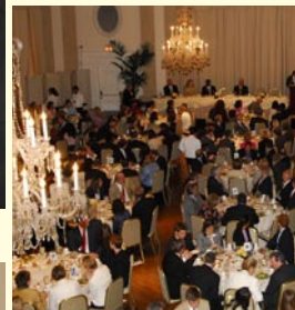
The swearing in ceremony